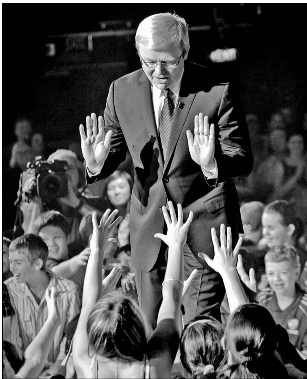
ROCK STAR RUDD ... Prime Minister Kevin Rudd at ABC studios yesterday