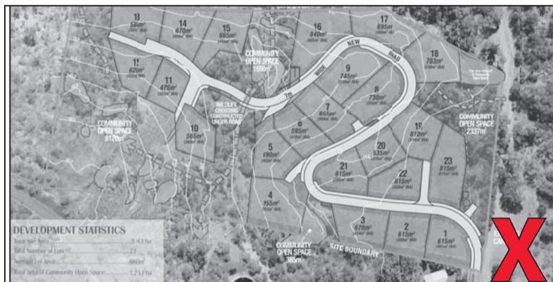
NO . . . the rejected plan which included 23 sites

"The private co-respondents who are the true heroes here, standing up for the people at huge personal and financial cost, have been ultimately overwhelmed by the costs to remain involved," he said.