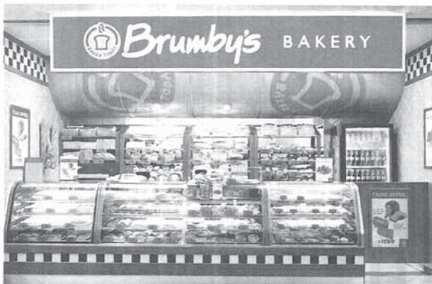
TASTY . . . Brumby's has been part of the North since 1994